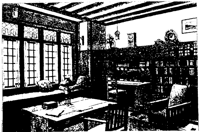
Fig. 3: Arts and Crafts interior, published in "The Craftsman," December 1905

A half-century later, many of the same reformist impulses