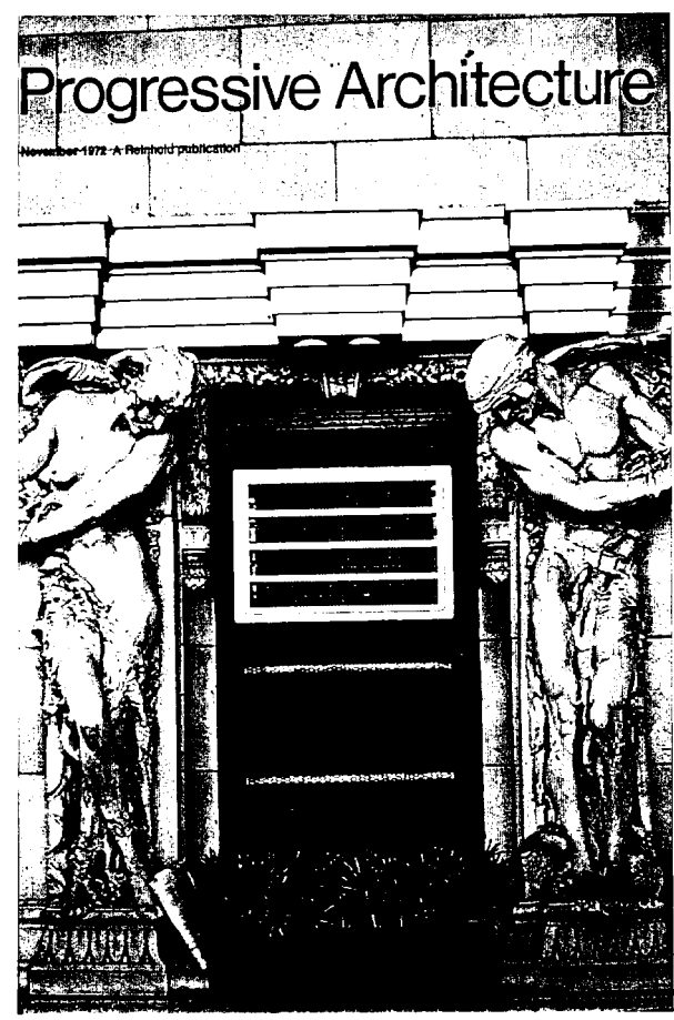
Fig. 4: cover from Progressive Architecture.

The ability of design/build practice to address the full range of scales demanded by the concept of sustainability is limited by the very issues it has chosen to engage. There is